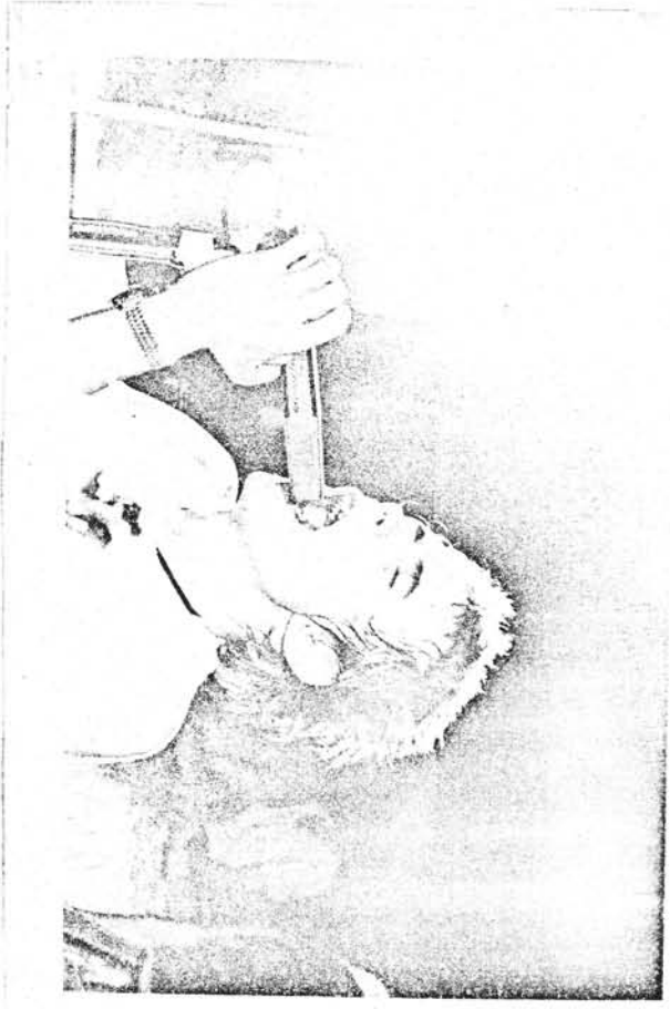
JOHNNY ROTTEN SEX PISTOLS